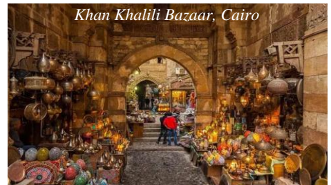
Khan Khalili Bazaar, Cairo

After breakfast, our first stop today is the famous Cairo Egyptian Museum . Here discoveries from the tombs and cities throughout Egypt are exhibited. The treasures of Tanis that rival the "King Tut" collections, the Narmer Pallet (earliest unification of Upper and Lower Egypt about 5,000 years ago), as well as many other interesting exhibits from the various periods of ancient Egyptian history are on display. We will tour Old Cairo Coptic and Jewish communities , the Citadel , Mohammed Ali Alabaster Mosque , and pay a visit to the world-famous Khan Khalili Bazaar for shopping.